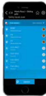
Safety accessories status